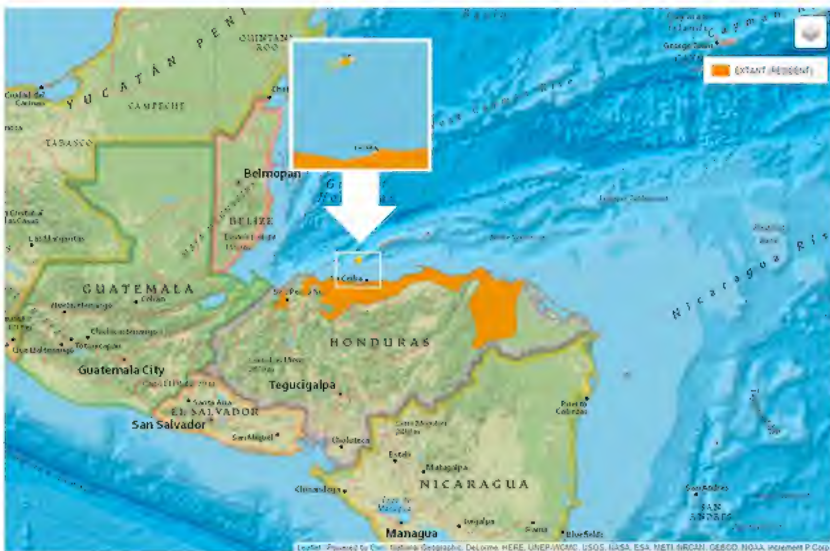
Fig 3. Google Earth © map hosted on the IUCN platform for Sphaerodactylus durni (Townsend et al. 2013), illustrating the known range of the species on mainland Honduras, modified to include the new locality on Utila Island (X), part of Islas de la Bahía. Map data: see Google Earth ( https://www.google.com/earth/ ) and Townsend et al. (2013).

rainforest habitat at Pico Bonito National Park during a visit by the first author in 2014. As is apparent, this individual from the La Cieba region (Fig. 4) shares key characteristics with the individual on Utila (Figs. 1 and 2). During the Pleistocene glacial advances, Utila was probably connected with the Honduran mainland (Vinson and Brineman 1963; Wilson and Hahn 1973), and so there is the possibility that S. durni has existed on Utila for the considerable time since that separation. Alternatively, the encountered individual could have been introduced more recently. Future study by Kanahau URCF aims to use genetic processing of the sampled Utila individual to compare the genetic divergence of a broadly used genetic marker with the mainland S. durni population. This comparison will allow a better understanding of when S. durni colonized Utila, and whether the island populations are distinct from the mainland ones on a genetic level.