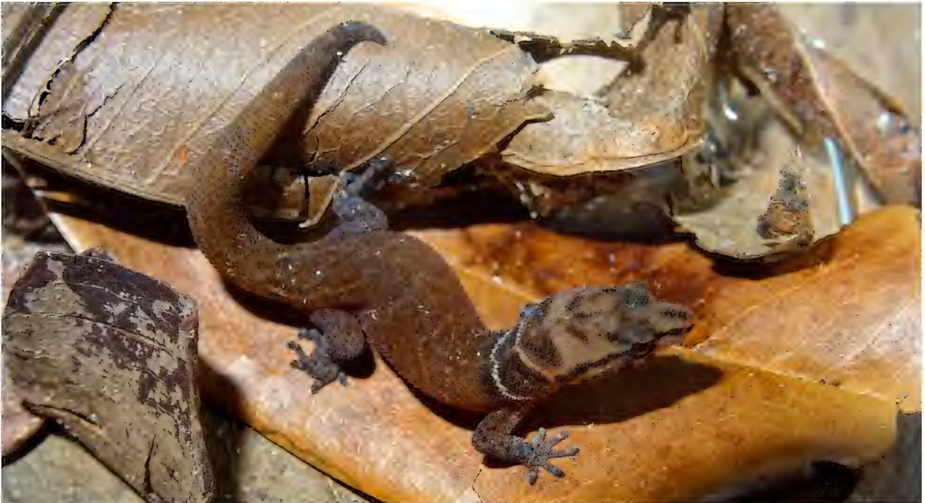
Fig 1. An adult Sphaerodactylus dunni photographed upon capture at its newly reported locality on Isla de Utila, Honduras.

was only known from elevations of 60–700 m asl on the Atlantic versant of northwestern to northeastern Honduras in primary lowland moist and dry forest formations (Townsend et al. 2013; McCranie 2018). Previous reviews of its conservation status placed S. dunni in the lower portion of the high vulnerability category, with an Environmental Vulnerability Score (EVS) of 14 (Wilson and McCranie 2003) and 15 (Johnson et al. 2015). Wilson and McCranie (2003) reported that S. dunni has a stable population trend within its restricted Honduran range, and subsequently it was listed as Least Concern by the IUCN Redlist (Townsend et al. 2013).