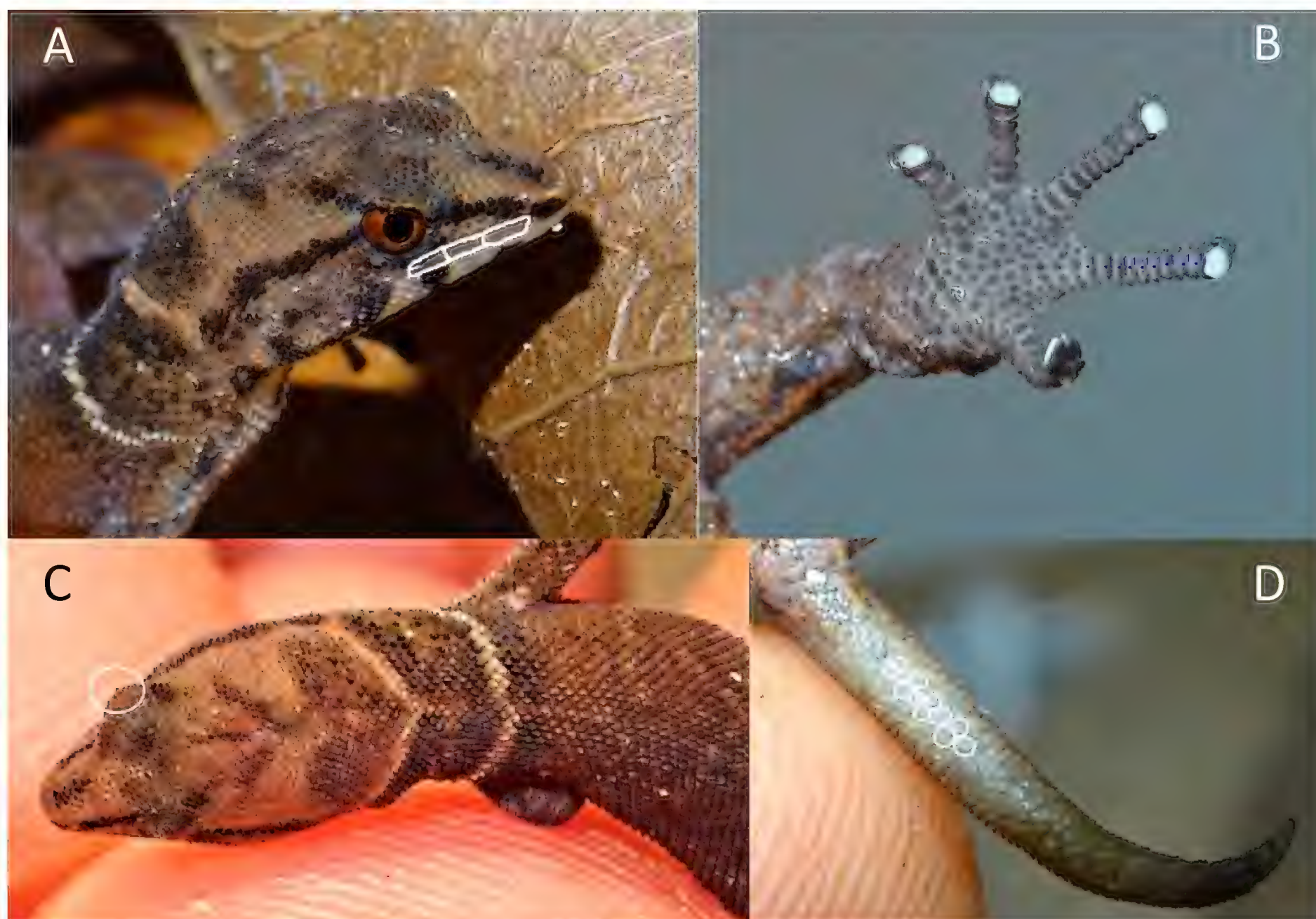
Fig 2. Key diagnostic features (outlined in white or indicated in blue) used to identify the captured individual as Sphaerodactylus dunni on Isla de Utila, Honduras. (A) Three supralabial scales positioned beneath/level to the lower anterior half of each eye; (B) nine narrow sub-digital lamellae on digit IV (described range of 7–11); (C) keeled dorsal scales (not outlined) and usually a superciliary spine located at or posterior to the level of the mid-eye; (D) subcaudal scales in alternating series on tail.

Morphometric data are presented in Table 1.