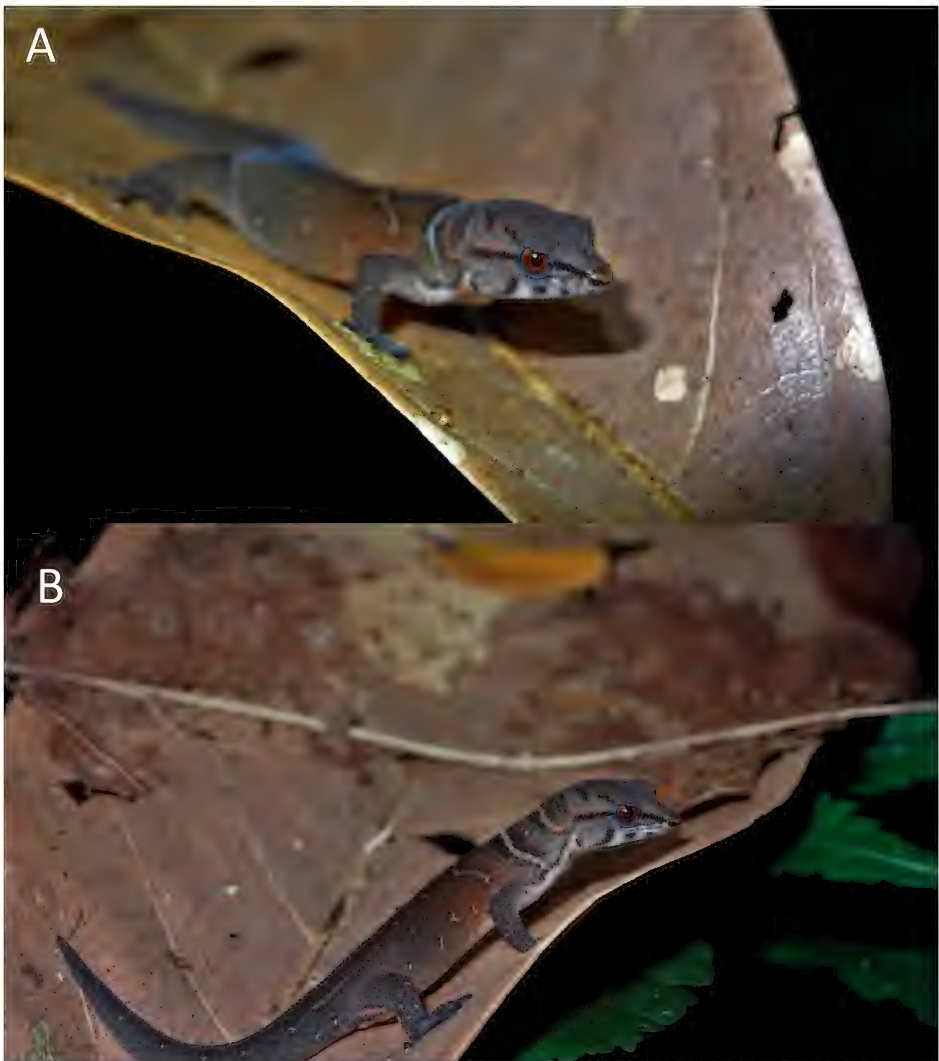
Fig 4. Pictures of an adult Sphaerodactylus dunnii photographed in 2014, in Pico Bonito National Park, La Cieba, Honduras, to provide direct comparison and aid in confirmation of the species' presence on Utila Island.

vulnerable status of S. dunnii in Honduras, and given its sympatric occurrence with other members of the S. millipunctatus group in its mainland range (McCranie 2018), we would not consider the newly recorded S. dunnii as an invasive species or competitor to other Sphaerodactylus species on Utila. Instead, pending further confirmation, we propose S. dunnii as an indigenous species and part of the island's unique herpetofaunal assemblage. The unexpected presence of S. dunnii is yet another reason for the immediate conservation of the threatened forest ecosystems of Utila.